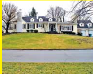
220 E. DIXON AVENUE CLASSIC & DISTINCTIVE. EXCEPTIONAL REAR YARD! 4 BEDROOMS, 2 1/2 BATHS $349,900 Listing #458746