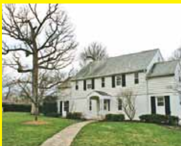
2422 ADIRONDACK TRAIL KETTERING 5 BEDROOMS, 3 FULL, 2 HALF BATHS $329,900 Listing #458448