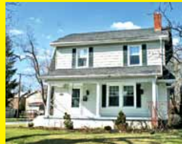
401 WILTSHIRE BOULEVARD CHARMING COLONIAL ~ NEW BATH! 3 BEDROOMS, 2 BATHS $187,900 Listing # 464411