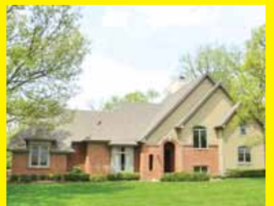
3121 BIG HILL ROAD KETTERING $399,900 #458766