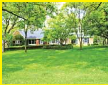
767 GREENHOUSE DRIVE KETTERING 3 BEDROOM, 3 1/2 BATHS $489,900 Listing #469239