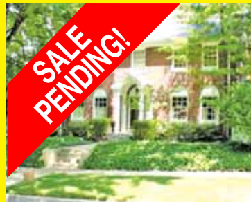
104 RUBICON ELEGANT COLONIAL, 4 BED- ROOM, 2 FULL and 2 HALF BATHS $319,900 Listing#462520

to preview INTERIOR photos of our fine listings