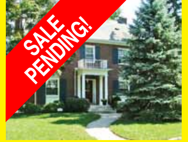
300 DIXON AVENUE TIMELESS BEAUTY 5 BEDROOMS, 4 1/2 BATHS $384,900 Listing #462129