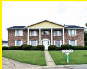
5086 MORELAWN COURT CENTERVILLE, $274,900 INVESTMENT PROPERTY #448399