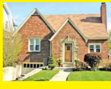
249 ORCHARD DRIVE CHARMING CAPE COD 3 BEDROOM, 2 BATHS $199,900 Listing #468679