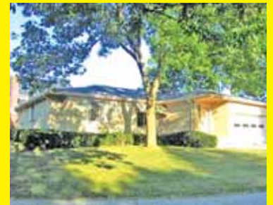
575 HATHAWAY ROAD COMFORTABLE, FRESH & CLEAN RANCH HOME 3 BEDROOMS, 2 BATHS $159,900 Listing #429502