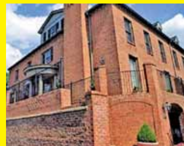
1716 S. MAIN STREET STUNNING, 4 LEVEL TOWNHOUSE/ RUBICON MILL 3 BEDROOMS, 3 1/2 BATHS Listing #438624