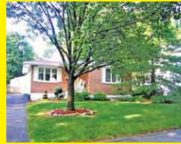
416 TELFORD AVENUE DELIGHTFUL FLOOR PLAN, LL GAME ROOM & NEW ROOF 2 BEDROOM, 2 BATH $139,900 Listing #445569