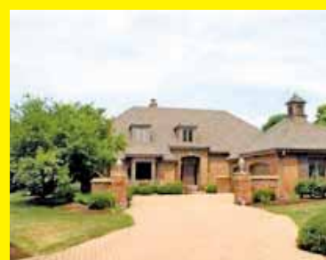
5904 SPICE BUSH WASHINGTON TWP. 4 BEDROOMS, 3 BATHS $539,900 LISTING #463489