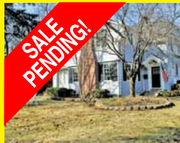
345 VOLUSIA AVENUE LOVELY INTERIOR WITH A COTTAGE FEEL 3 BEDROOMS, 1 1/2 BATHS $169,900 Listing #460340