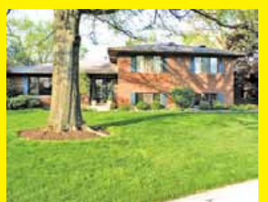
66 ZENGEL COURT CENTERVILLE 3 BEDROOMS, 2 1/2 BATHS $239,900 Listing #468013