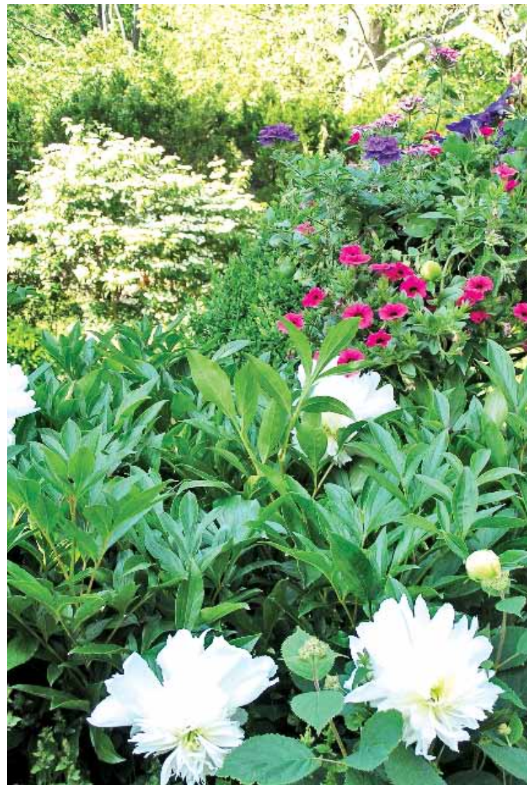
Ellie Shulman's garden

One of AAG's primary goals is to make its informational resources available to researchers, landscape designers, garden enthusiasts and the general public for a variety of educational purposes. To make these collections readily