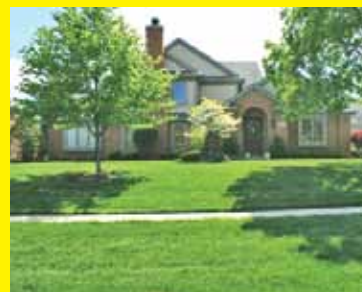
2316 VIENNA WOODS TRAIL MIAMI TOWNSHIP 3 BEDROOMS 2 1/2 BATHS $249,000 Listing #469491