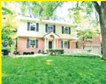
230 SCHENCK AVENUE STEEPED IN COMFORT 5 BEDROOMS, 3 BATHS $399,900 Listing #461619