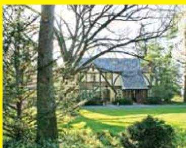
3549 SPRINGDALE DRIVE KETTERING $409,900 #460228