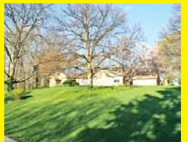
3232 BLOSSOM HEATH KETTERING 3 BEDROOMS, 2 1/2 BATHS $217,900 #467440