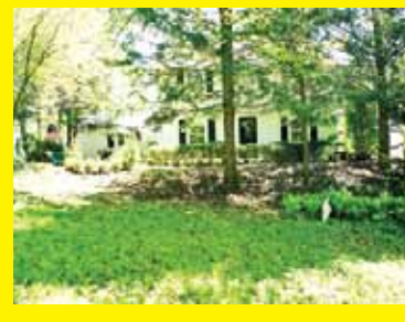
5227 LITTLE WOODS LANE WASHINGTON TOWNSHIP 5 BEDROOMS, 3 1/2 BATHS $499,000