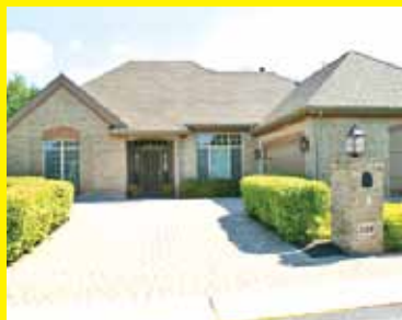
126 RUE MARSEILLE KETTERING $397,700 #450722