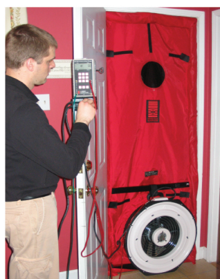
Infiltrator Blower Door Test Instrument.