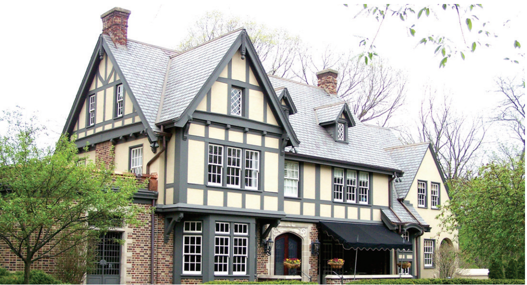
Ridgeway Road, Oakwood