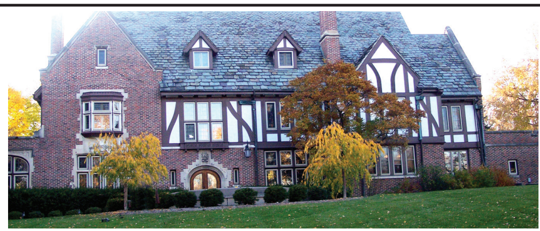
Southview Road, Oakwood