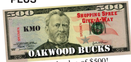
Actual value of $500!