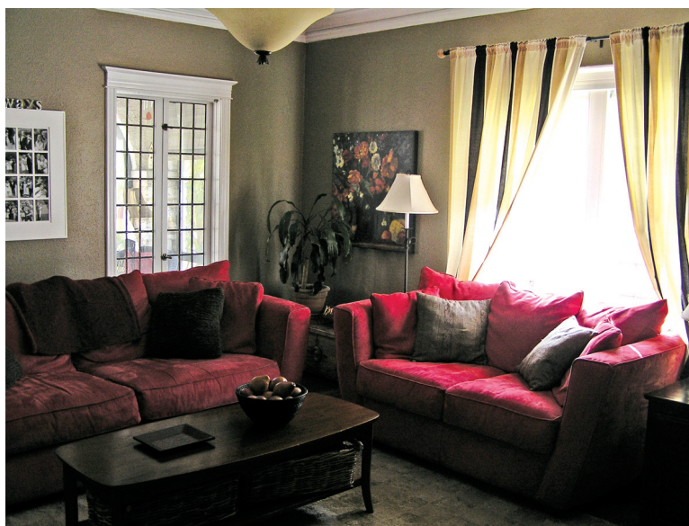
Family room is colorful and tasteful.

EXPERIENCED & SOPHISTICATED RESIDENTIAL & COMMERCIAL