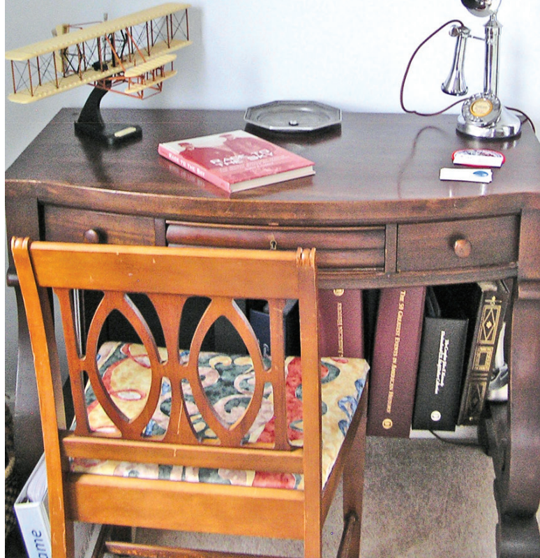
Desk in study is replete with souvenirs.