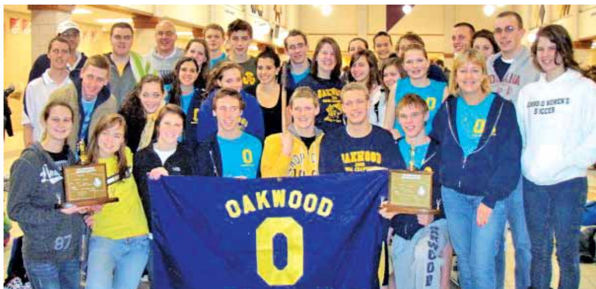
The OHS swim team

For the boy's team, league championship individual event winners