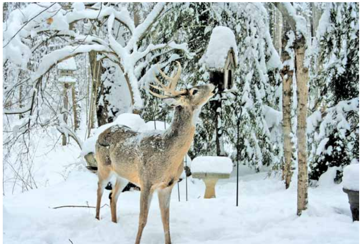
Oakwood's herbivore urban deer: delicacies appear to include hosta in springtime, sunflower seeds in winter. Photo taken at Steve Harman's backyard bird/deer feeder on West Forrer Road.

PRIME INVESTMENT OPPORTUNITY Luxury beachfront apartments within a 5-star beach front resort on the North Coast of Dominican Republic, 20 minutes from the international airport at Puerto Plata